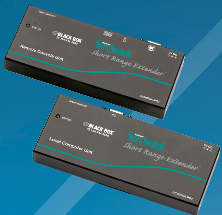
ACU075A-PS2: front view: top: Console Unit; bottom: Computer Unit