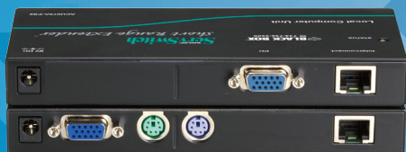
ACU075A-PS2: back view: top: Computer Unit; bottom: Console Unit