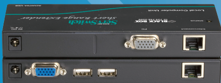
ACU075A-USB: back view: top: Computer Unit; bottom: Console Unit